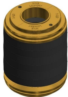
Big Dome Packing